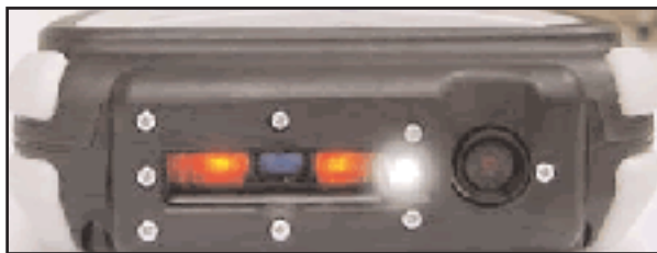
JETT•eye showing the camera, bar code imager and LED flashlight

A first for the JETT•RFID+ is the future-proof Software Defined Radio (SDR) architecture. SDR allows for new protocols and tags to be supported by existing hardware as they become available through simple field upgrades.